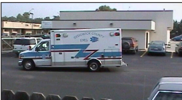
This ambulance left empty after being asked to stand by in the event it was needed. This rare day, it was not.

July 12-13, 2005 – Ambulances were summoned to Women’s Health Care Services